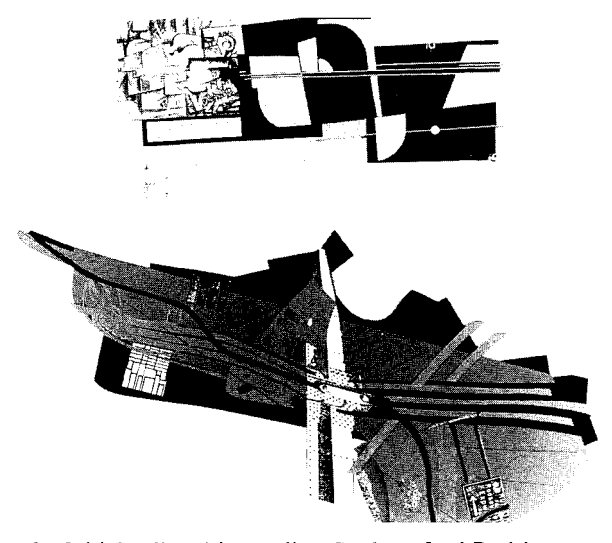
Figure 2: Initial collage/site studies. Student: José Rodriguez

occupy the study area that included both banks of the river. The difficulty of seeing this palimpsest of histories and adjacencies is compounded by the enormous excavation that