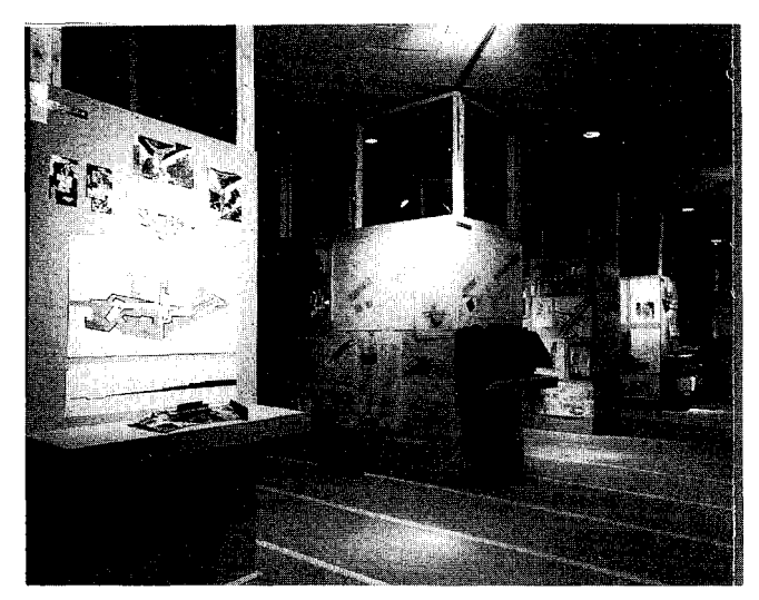
Figure 1: Installation/Exhibition of Temple University Summer Program for Architectural Studies, September, 1993, Philadelphia, Pennsylvania.

For the first 250 years of its occupation by European settlers this site in East Falls marked the coincidence of two major transportation arteries; the Schuylkill River and Ridge Avenue. A Native American trail that pre-dates the Pennsylvania colony, Ridge Avenue continued to serve as the major transportation link with the once rich mineral reserves of northeastern Pennsylvania until the construction of the Interstate Highway System after W.W.II. In addition to the elevated roadway of Rt. 1, two major train lines, a stone rail bridge, a steel tower for electric power lines and the northern tip of Mount Laurel Cemetery (a national historic site) all co-